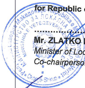
..... Mr. ZLATKO PERINSKI Minister of Local-Self Government Co-chairperson of Monitoring Committee