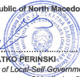
..... Mr. ZLATKO PERINSKI Minister of Local-Self Government Co-chairperson of Monitoring Committee