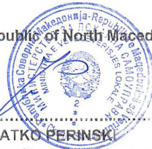
..... Mr. ZLATKO PERINSKI Minister of Local-Self Government Co-chairperson of Monitoring Committee