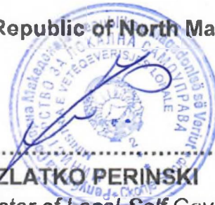
..... Mr. ZLATKO PERINSKI Minister of Local-Self Government Co-chairperson of Monitoring Committee