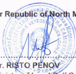
..... Mr. RISTO PENOV Minister of Local Self Government Co-chairperson of Monitoring Committee